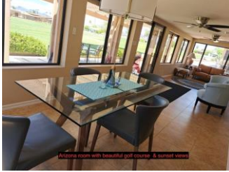
Arizona room with beautiful golf course & sunset views