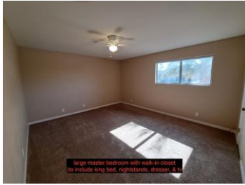
Large master bedroom with walk-in closet No include king bed, nightstands, dresser, & tv