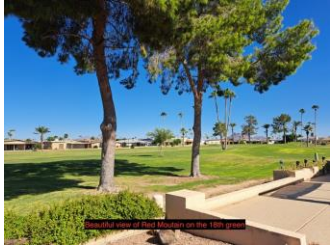
Beautiful view of golf course on the 18th green