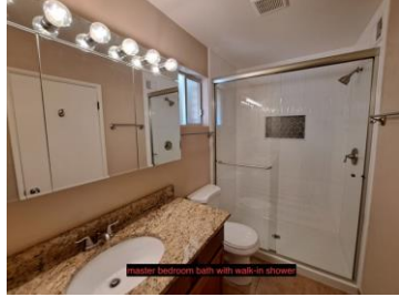
Master bedroom bath with walk-in shower