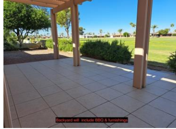
Backyard with BBQ & barbecue