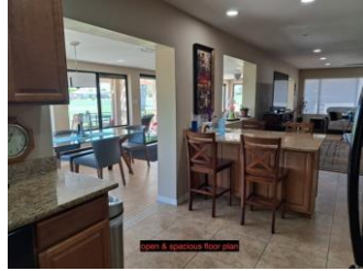
Open & spacious floor plan