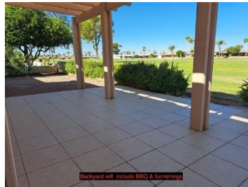
Backyard will include BBQ & sunroom.