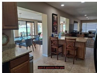
Open & spacious floor plan.