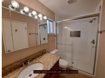
Master bedroom bath with walk-in shower.