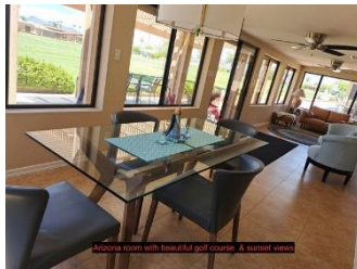
Kitchen with breakfast bar, dining table, & island.