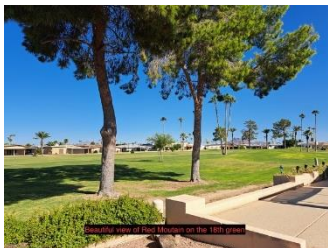
View of the 18th green from the 18th green.