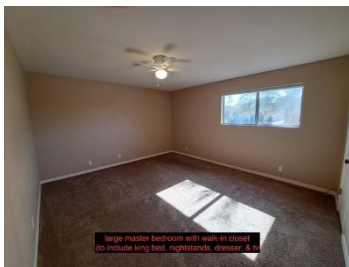
Large master bedroom with walk-in closet. Includes king bed, nightstands, dresser, & tv.

For rent: 2 BR, 2BA, 1900 sq. ft. Home on the 18 th green! Wonderfully furnished home available Nov. 1, 2024, for a minimum 5-month term in a 55+ community. Beautiful sunset and Red Mtn views!! Very spacious throughout. Large TV in living room. Master BD has a king bed, 2 nightstands, and dresser, in addition to a walk-in closet and TV. 2nd BD/office has a queen Murphy bed and 2 closets. Indoor W/D, R/O drinking water system, and 2-car enclosed garage. BBQ and patio furniture also. All utilities + cable TV + internet included. $2850/mo + deposit. No smoking/no pets. For more info, contact Michelle at (509) 954-4026 or michwaswild@gmail.com. (9/03/24)